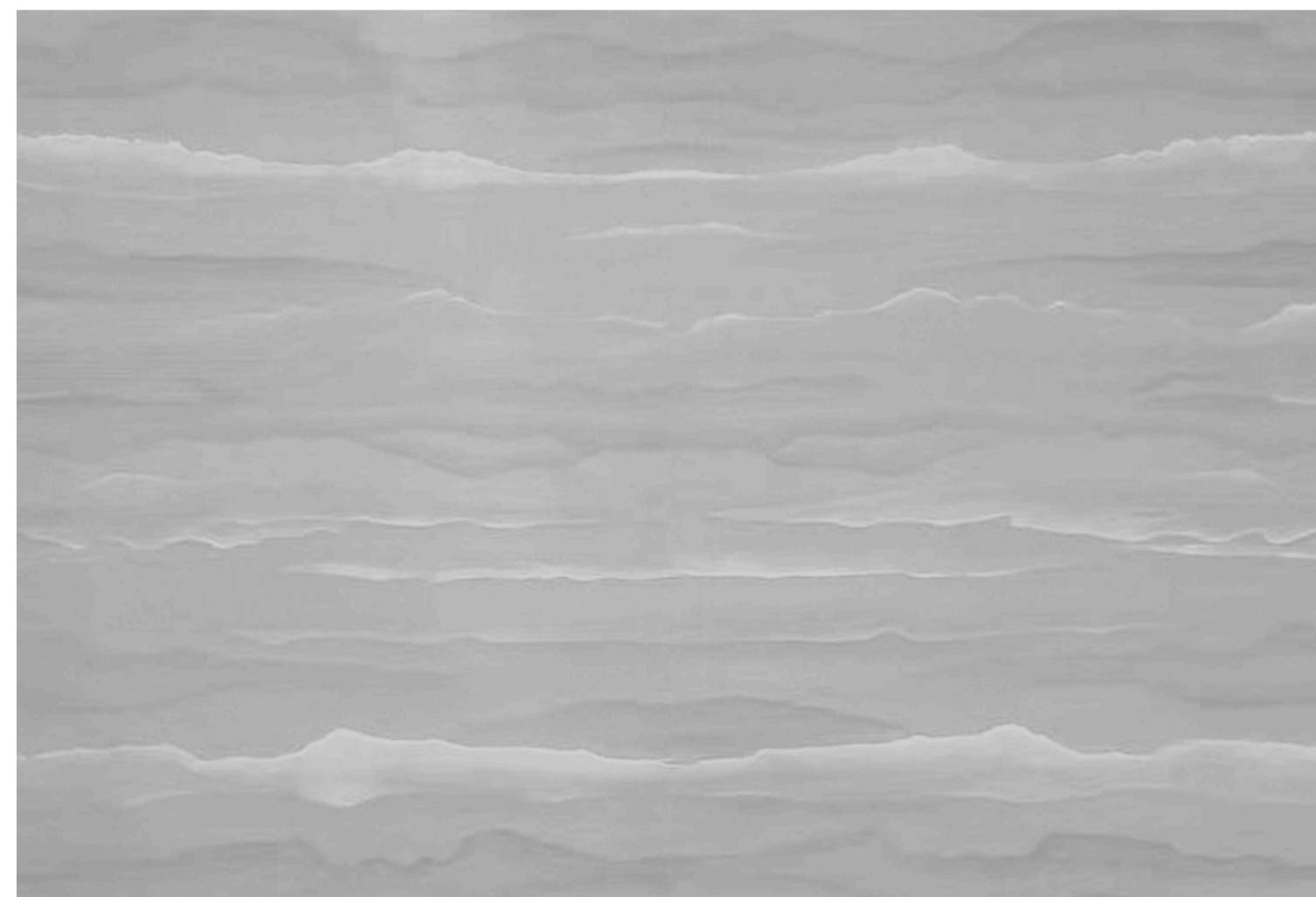
Lines White on Artificial sleek silk / HP-AS-05