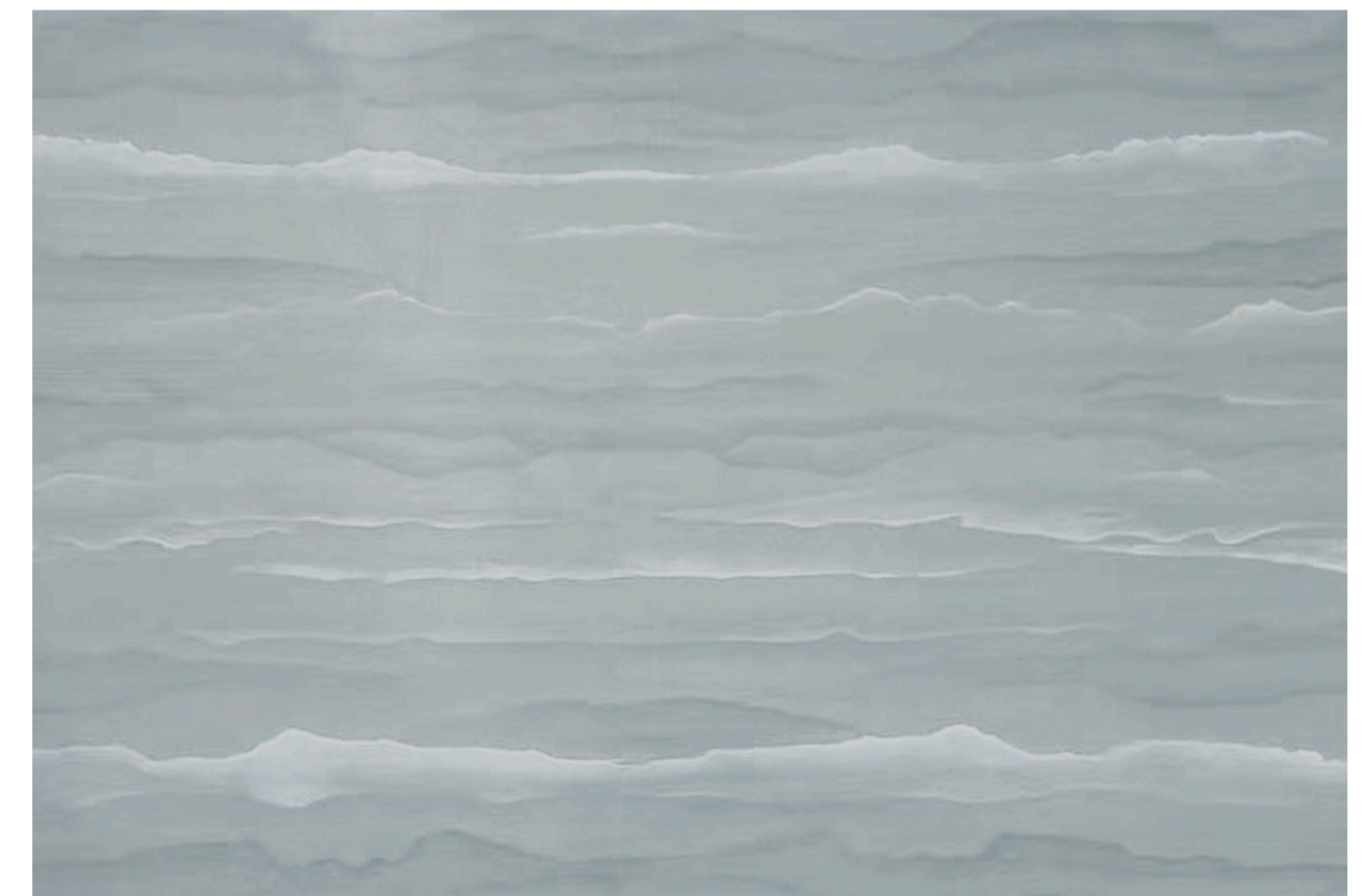
Lines White on Artificial sleek silk / HP-AS-06

Selection of the background materials for hand-painted wallcoverings from our plain collections: