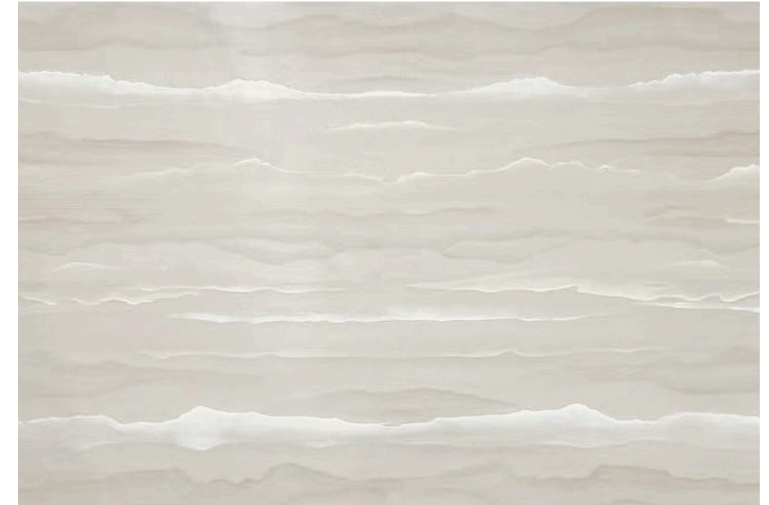
Lines White on Artificial sleek silk / HP-AS-03