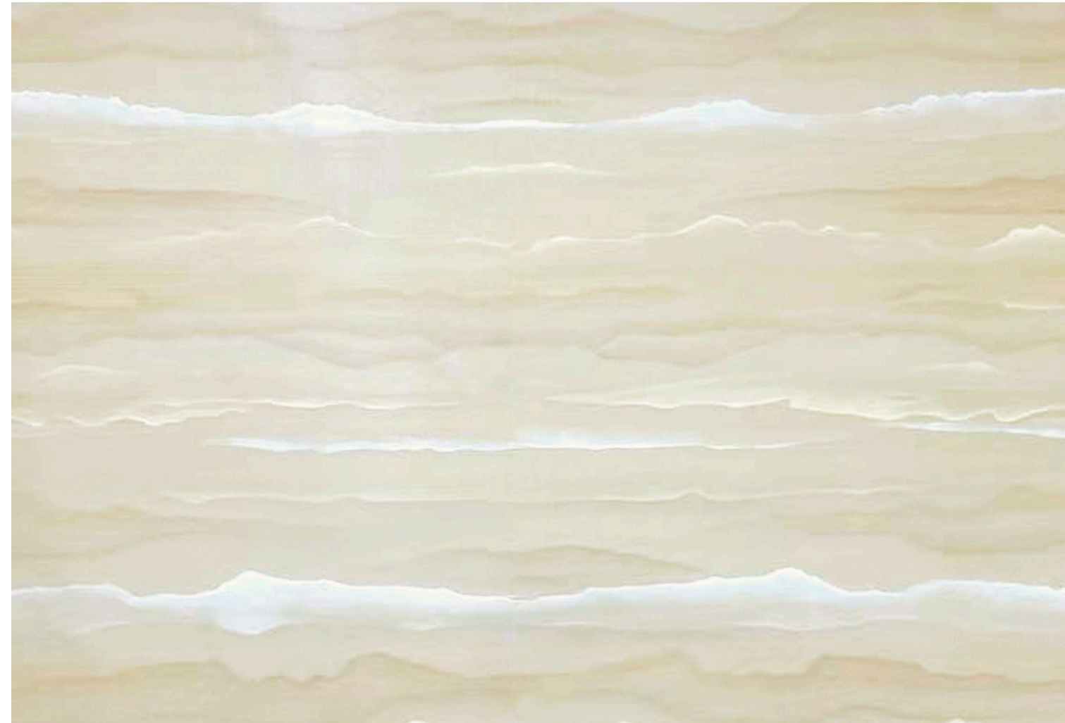
Lines White on Artificial sleek silk / HP-AS-01