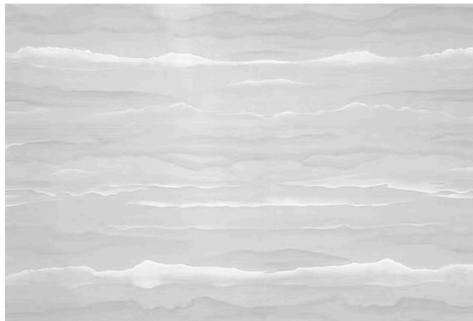
Lines White on Artificial sleek silk / HP-AS-04