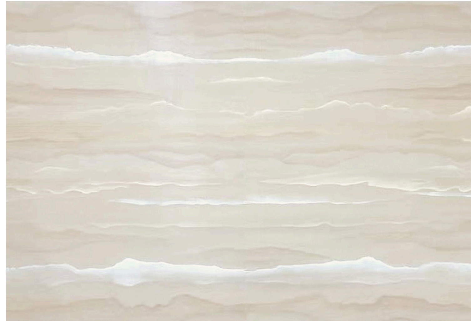
Lines White on Artificial sleek silk / HP-AS-02